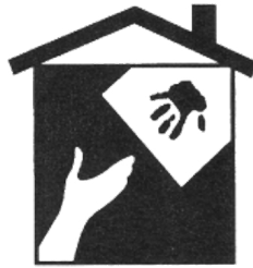
The Poshard Foundation for Abused Children